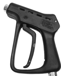
ST2000 TRIGGER GUN

PART NO. - STANDARD: 202885 WEEP: 206276 REPAIR KIT - STANDARD: 202501 WEEP: 206317