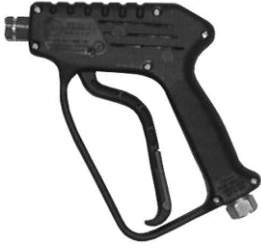
G250V TRIGGER GUN

PRESSURE: 4000 PSI FLOW RATE: 12 GPM TEMPERATURE: 300°F WEIGHT: 25 OZ INLET - OUTLET: 3/8" FNPT - 1/4" FNPT PART NO.: 240155 / REPAIR KIT: 220304