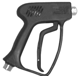
ST1500 TRIGGER GUN

PRESSURE: 5000 PSI FLOW RATE: 12 GPM TEMPERATURE: 300°F WEIGHT: 20.5 OZ INLET - OUTLET: 3/8"FNPT - 1/4" FNPT