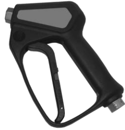
ST2700 SS "RELAX ACTION" TRIGGER GUN

PRESSURE: 5000 PSI FLOW RATE: 12 GPM TEMPERATURE: 300°F WEIGHT: 21 OZ INLET-OUTLET: 3/8"FNPT - 1/4" FNPT PART NO.: 202861 / REPAIR KIT: 206312