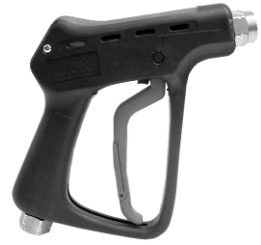
ST3002 TRIGGER GUN

PART NO. - STANDARD: 200803 WEEP: 200806 REPAIR KIT - STANDARD: 202501 WEEP: 206317