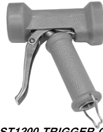
ST1200 TRIGGER GUN

PRESSURE: 4000 PSI FLOW RATE: 12 GPM TEMPERATURE: 300°F WEIGHT: 25 OZ INLET - OUTLET: 3/8" FNPT - 1/4" FNPT PART NO.: 240155 / REPAIR KIT: 220304