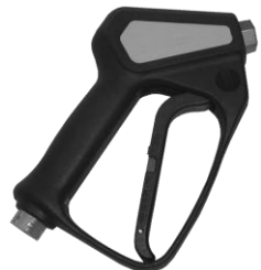
ST2605 "RELAX ACTION" TRIGGER GUN

PRESSURE: 5000 PSI FLOW RATE: 12 GPM TEMPERATURE: 300°F WEIGHT: 21 OZ INLET-OUTLET: 3/8"FNPT - 1/4" FNPT PART NO.: 202861 / REPAIR KIT: 206312