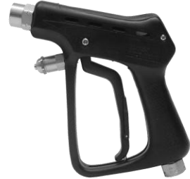
ST3100 FOAM SPRAY GUN

PRESSURE: 900 PSI FLOW RATE: 26 GPM TEMPERATURE: 176°F WEIGHT: 42.5 OZ INLET-OUTLET: 1/2"FNPT - 1/2" FNPT