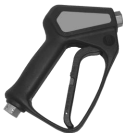
ST2705 "RELAX ACTION" TRIGGER GUN

PRESSURE: 7300 PSI FLOW RATE: 8 GPM TEMPERATURE: 300°F WEIGHT: 22 OZ INLET-OUTLET: 3/8"FNPT - 1/4" FNPT