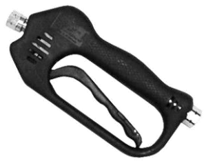
ST601 TRIGGER GUN

PRESSURE: 4000 PSI FLOW RATE: 12 GPM TEMPERATURE: 300°F WEIGHT: 23 OZ INLET-OUTLET: 3/8"FNPT - 1/4" FNPT